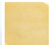
Amber Venetian Glass