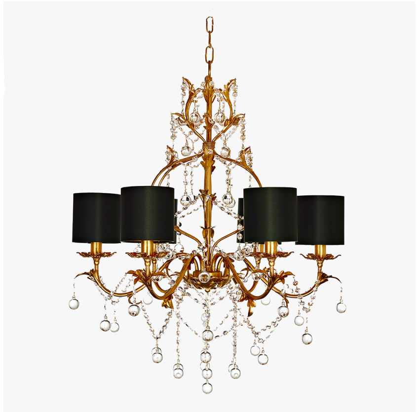
CL77-6 in antique gold with 5 inch shades in crepe satin 1806W/

IEC (International Electrotechnical Commission) test certificates available - will incur a surcharge UL (Underwriters Laboratories) test certificates available for the USA - will incur a surcharge