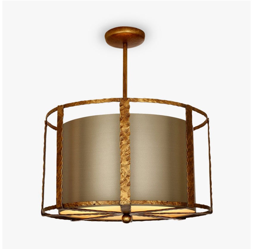
CL51 in hammered antique gold with CL51-50-Shade in 1806W/ 310 Timber Wolf