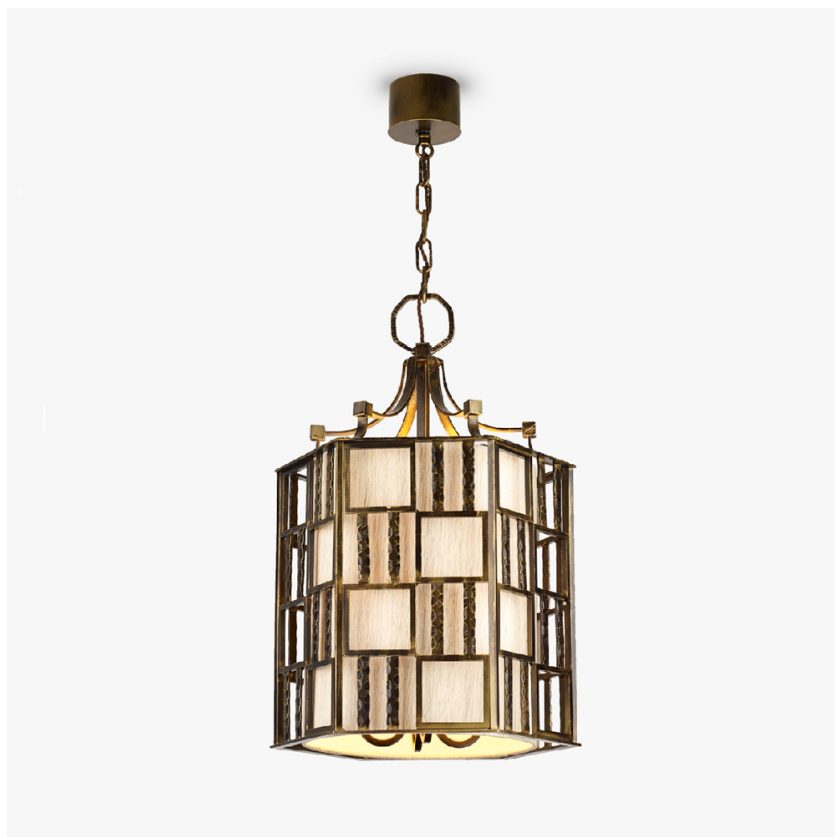
CL51-LAN in smooth and hammered decorated bronze with shade in 3998/W

UL (Underwriters Laboratories) test certificates available for the USA - will incur a surcharge IEC (International Electrotechnical Commission) test certificates available - will incur a surcharge