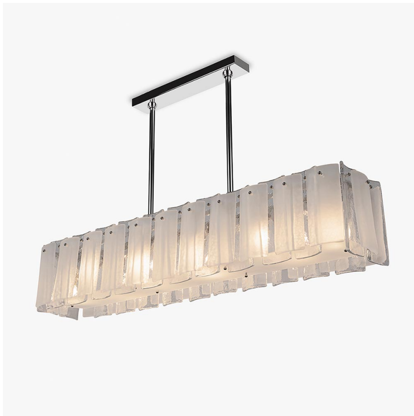
CL213-RECT in satin with clear glass and polished nickel

UL (Underwriters Laboratories) test certificates available for the USA - will incur a surcharge