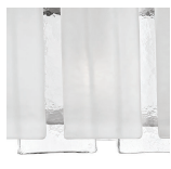
Lunar Satin with Clear