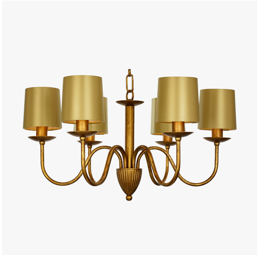
CL80-6 in antique gold with 5 inch melton shades in silk crepe satin 1806W/ 216 Pebble

UL (Underwriters Laboratories) test certificates available for the USA - will incur a surcharge