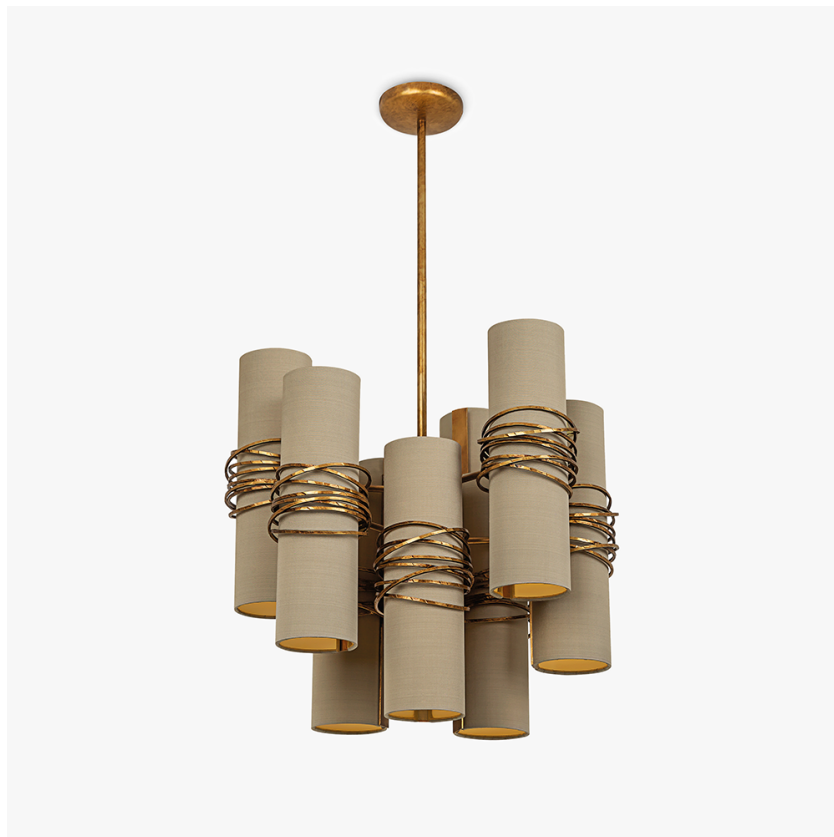
CL58 in hammered antique gold with 9 shades in dupion 5018W/1094