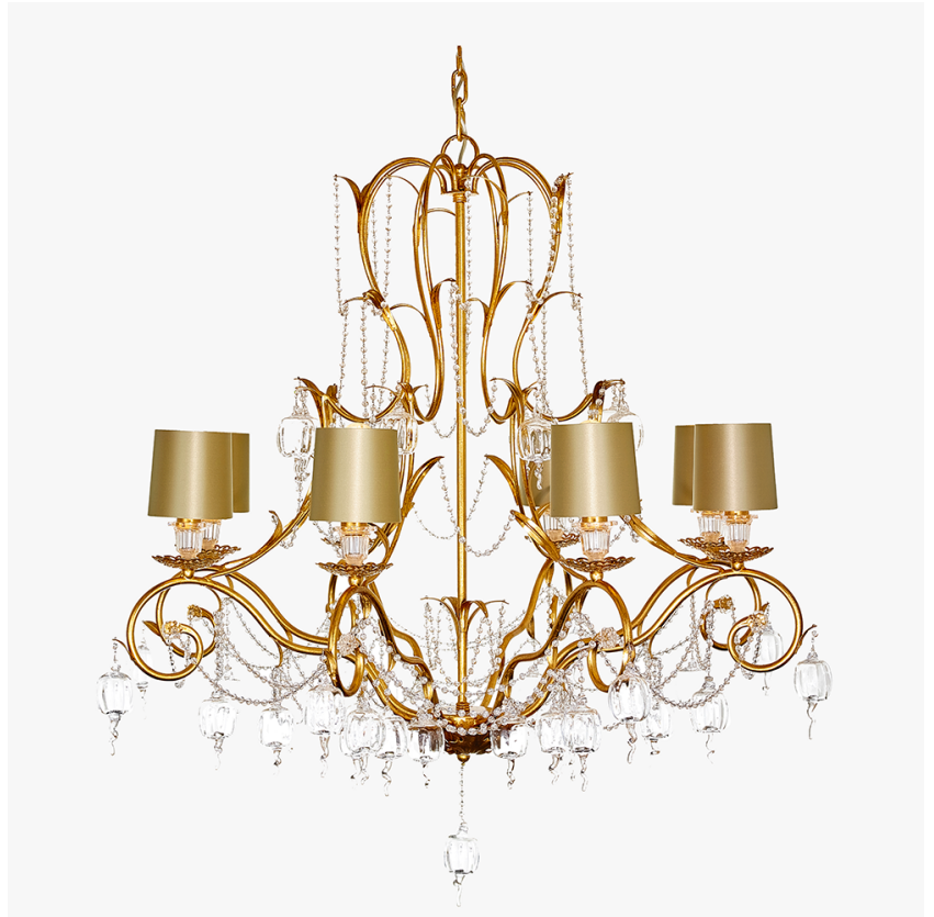
CL76-8 in antique gold leaf and clear Murano glass drops with 4 inch melton shades in silk crepe satin 1806W/ 216 Pebble

UL (Underwriters Laboratories) test certificates available for the USA - will incur a surcharge