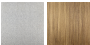
Brushed Nickel Brushed Brass