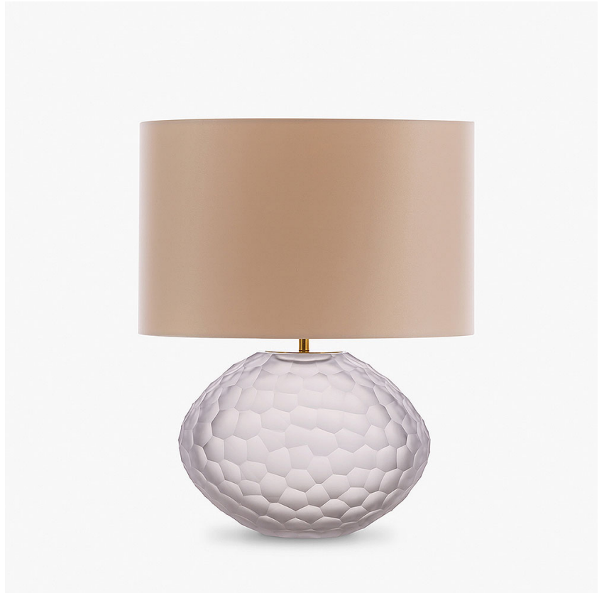
TL234 in Clear glass and Brushed gold with a 15" Oval shade in crepe satin 1806W 012 Frosted Almond

Atacama, Chile, is one of the driest areas in the world and within this remote desert lies beauty of ethereal quality. An extra-terrestrial landscape of pink birds and imposing, eerie pockets of water bubbling and jets of steam bursting into the sky. Most unusual of all is the vast white jigsaw spanning as far as the eye can see, the salt flats of Atacama. Our new design of the same name retraces the natural pattern scored through this salt mosaic in a delightful array of glass colours.