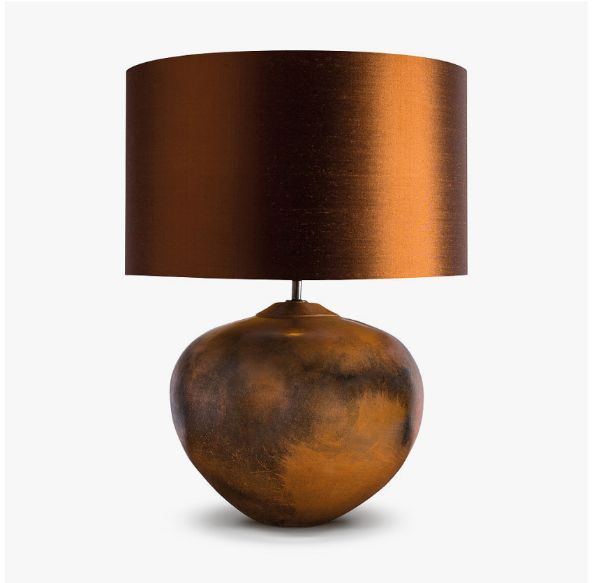
TL165 in burnt sienna and a 15" short drum shade

At scorching hot temperatures, the individually hand sculpted clay body is removed from the kiln and plunged into a vessel of combustibles; igniting flames which lick the surface of the lamp base and paint a smoky landscape on the outside. Throwing back to the ancient Japanese 'Raku' process, but made here in the UK, our Fornax table lamp is a true beauty, created where art meets science. These alluring table lamps are available in three unique finishes; Cinder, Desert and Burnt Sienna. Please note the intricate patterns on the surface of the Fornax range are created entirely organically from smoke and fire and will therefore vary slightly from piece to piece.