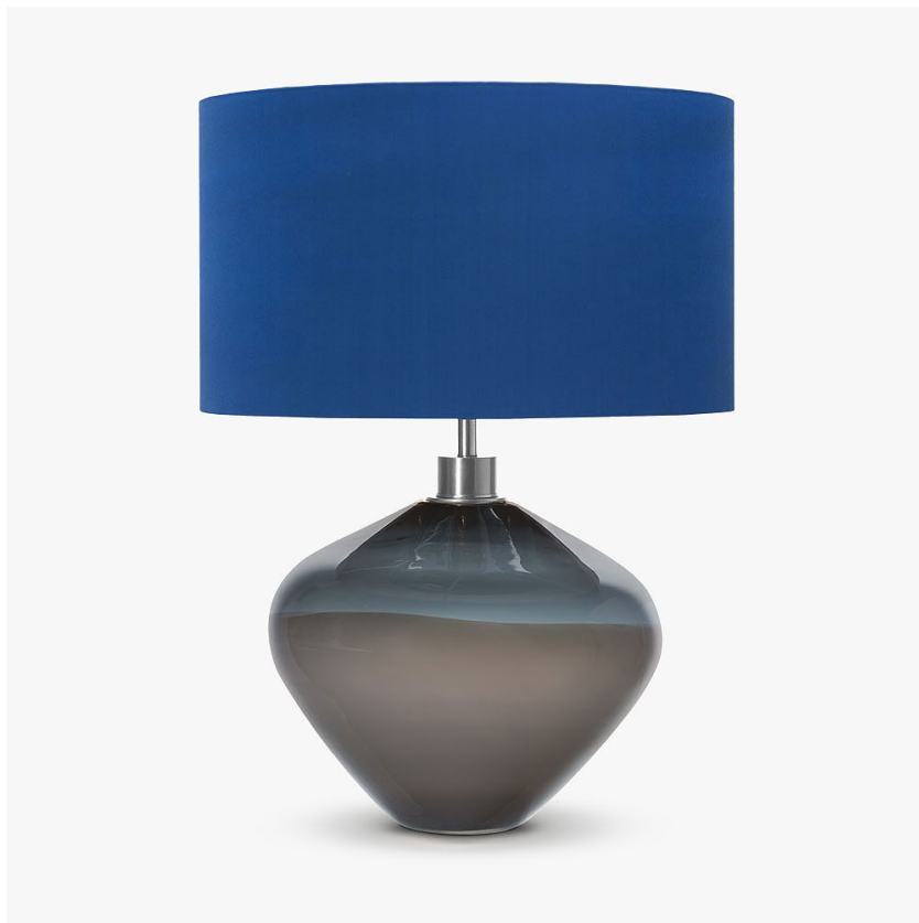
TL233 in mercury and brushed nickel with 15" short drum shade in silk crepe satin 039 Airforce

This gracefully re?ned new table lamp illustrates the beckoning optical phenomenon of a mirage, encapsulating the distorted boundary between earth and sky within glass. We welcome these ethereal lamp bases to the fold in three celestial and earthy tones.