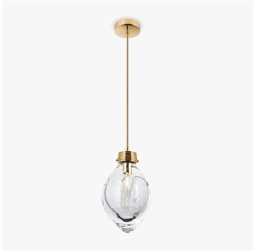
CL660-PEN in clear glass and a polished brass rod

Joining the Acorn family, the new Acorn pendant is a delicate design, each one is wrapped in a generous layer of glass, creating an abstract glass ribbon. Hand-crafted in our glass workshop in Britain, available in clear glass only, with either a rod or flex cord.