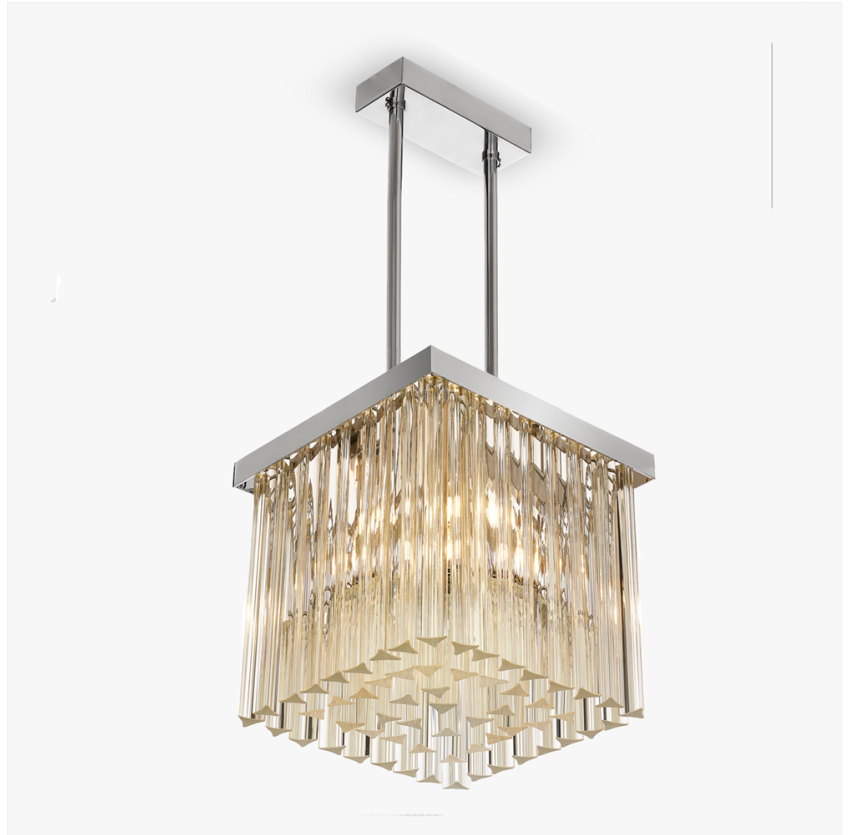
CL454 in clear triangular flat cut Murano glass rods and chrome

IEC (International Electrotechnical Commission) test certificates available - will incur a surcharge UL (Underwriters Laboratories) test certificates available for the USA - will incur a surcharge