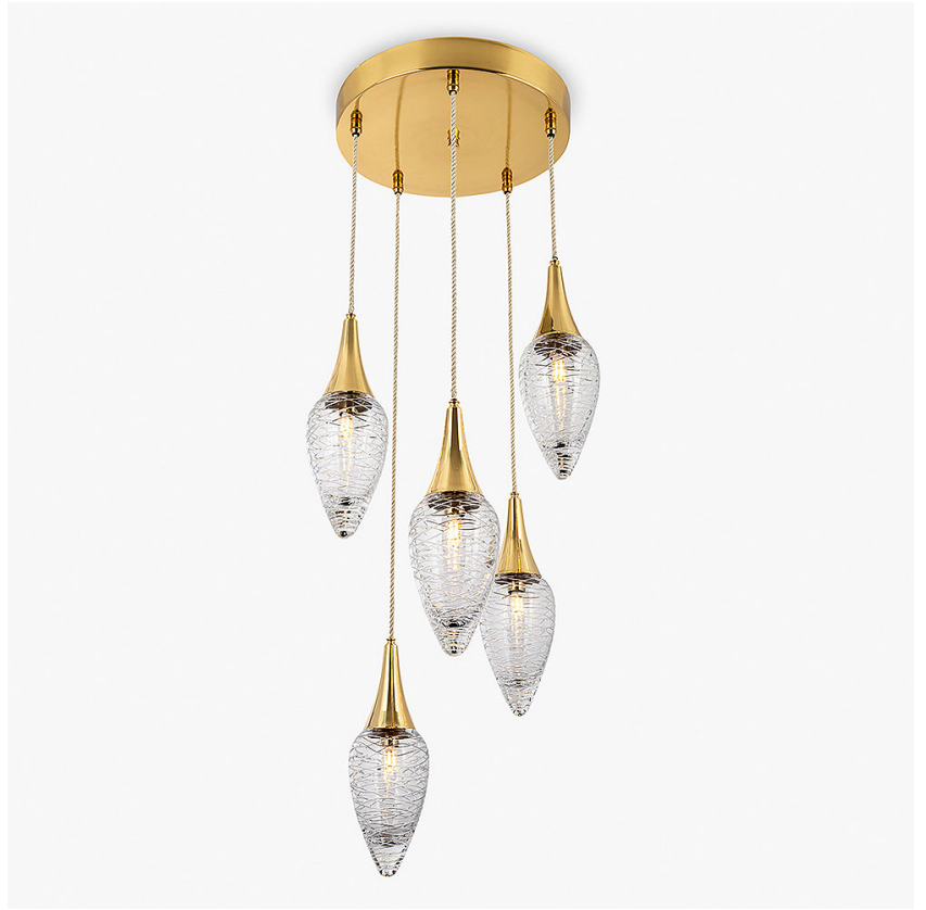
CL378-5 Lavalier pendant cluster in clear lead crystal and polished brass