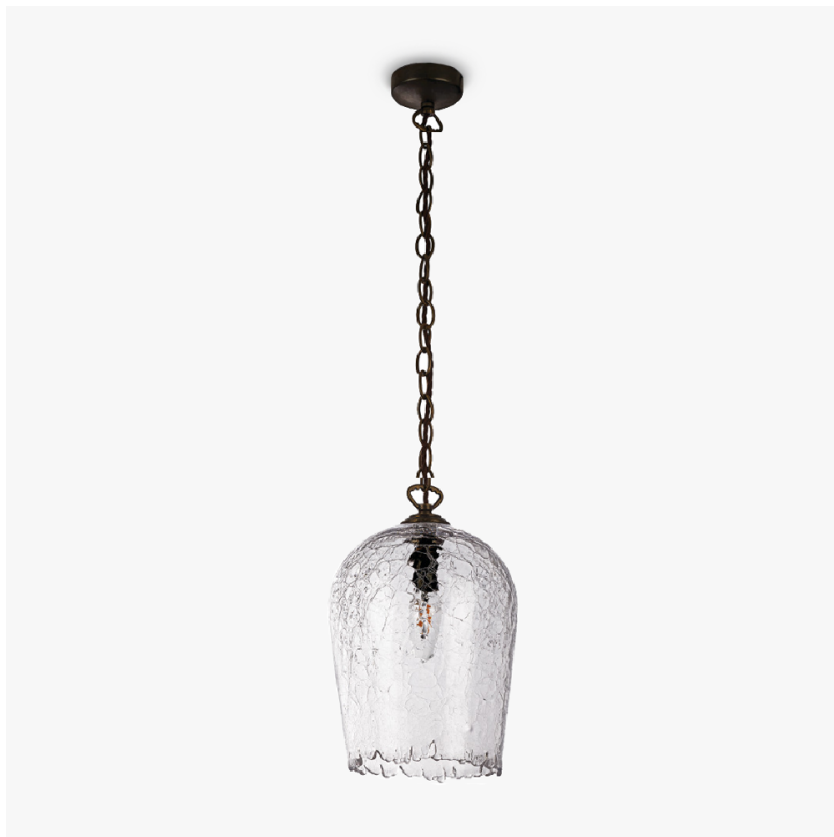
CL52-LA in clear crackled glass and old english brass chain

A classic pendant light with an artfully fractured edge and the crackled appearance of frozen ice, which encases the hand-blown glass beneath. Once lit, the refraction of light creates some truly exquisite patterns, which are unique to each pendant.