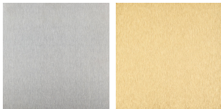
Brushed Nickel Brushed Gold