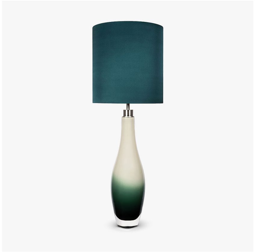
TL232 in belize blue and brushed nickel with 11" tall drum shade in silk crepe satin 1806W/ 63 Petrol

The Vista table lamp is an organic coalescence of light and dark. Complementing opaque and translucent glass tones surge into one another and swirl together to create an atmospheric illusion of rising mists. Finish Note: This design is hand crafted individually and will therefore vary slightly from piece to piece. The dimensions for this design shown are approximate due to this product being hand made