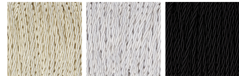
Cream Silver Black