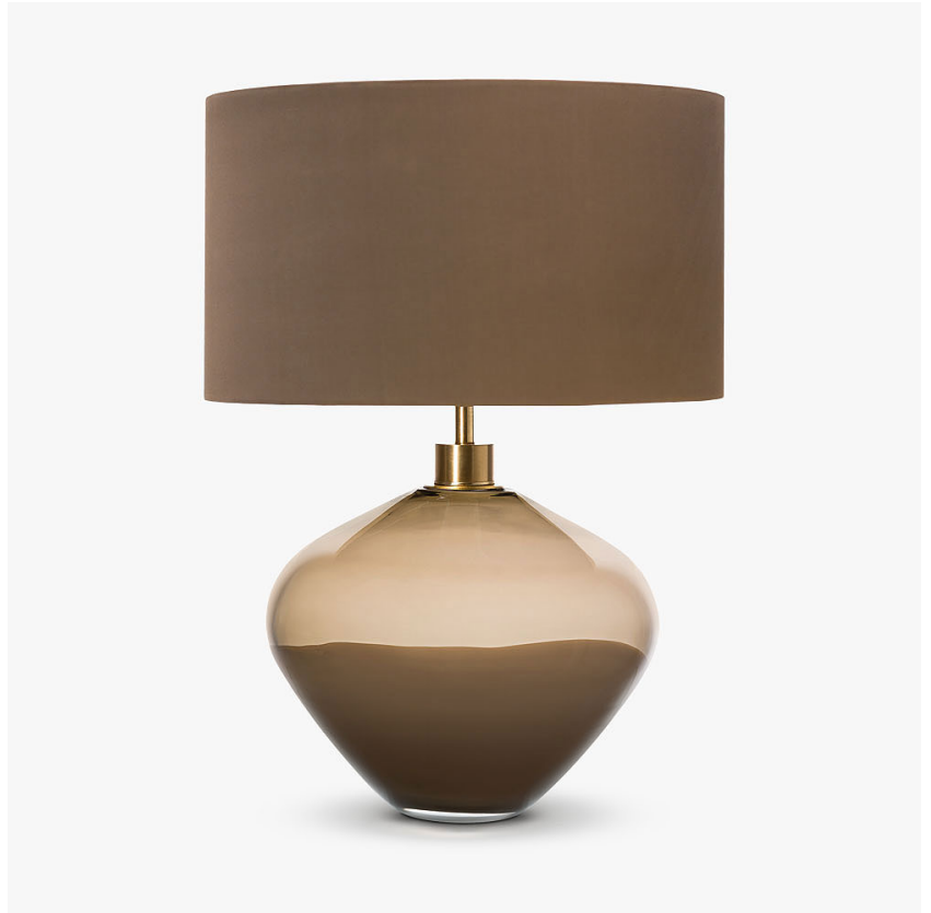
TL233 in olive brown and brushed gold with 15" short drum shade in silk crepe satin 1806W/ 326 Nutmeg

This gracefully re?ned new table lamp illustrates the beckoning optical phenomenon of a mirage, encapsulating the distorted boundary between earth and sky within glass. We welcome these ethereal lamp bases to the fold in three celestial and earthy tones. Finish Note: This design is individually crafted and therefore will vary slightly from piece to piece. The dimensions for this design shown are approximate due to this product being hand made.