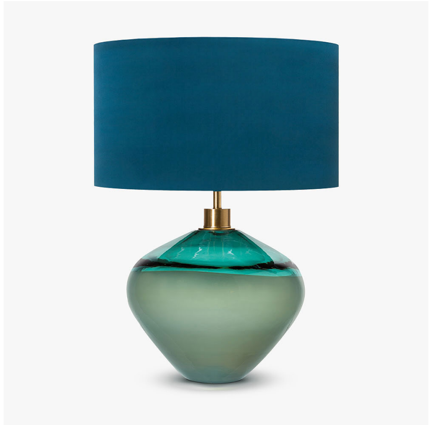
TL233 in aquamarine and brushed gold with 15" short drum shade in silk crepe satin 1806W/ 039 Airforce

This gracefully refined new table lamp illustrates the beckoning optical phenomenon of a mirage, encapsulating the distorted boundary between earth and sky within glass. We welcome these ethereal lamp bases to the fold in three celestial and earthy tones. Finish Note: This design is individually crafted and therefore will vary slightly from piece to piece. The dimensions for this design shown are approximate due to this product being hand made.