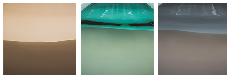
Olive Brown Aquamarine Mercury