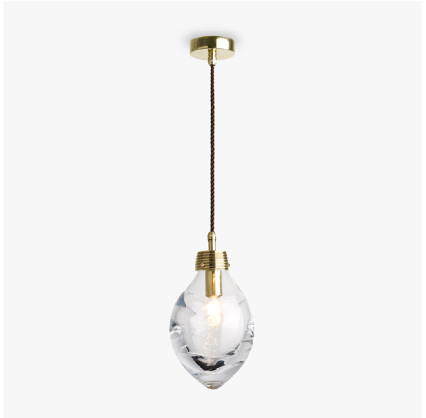
CL660-PEN in Clear Glass and Polished Brass with Brown Flex

Joining the Acorn family, the new Acorn pendant is a delicate design where each one is wrapped one by one in a generous layer of glass, creating almost an abstract glass ribbon. Hand crafted in our glass workshop in the UK using the best skill. Unlike our Acorn table lamps the pendant is currently only available in clear glass.