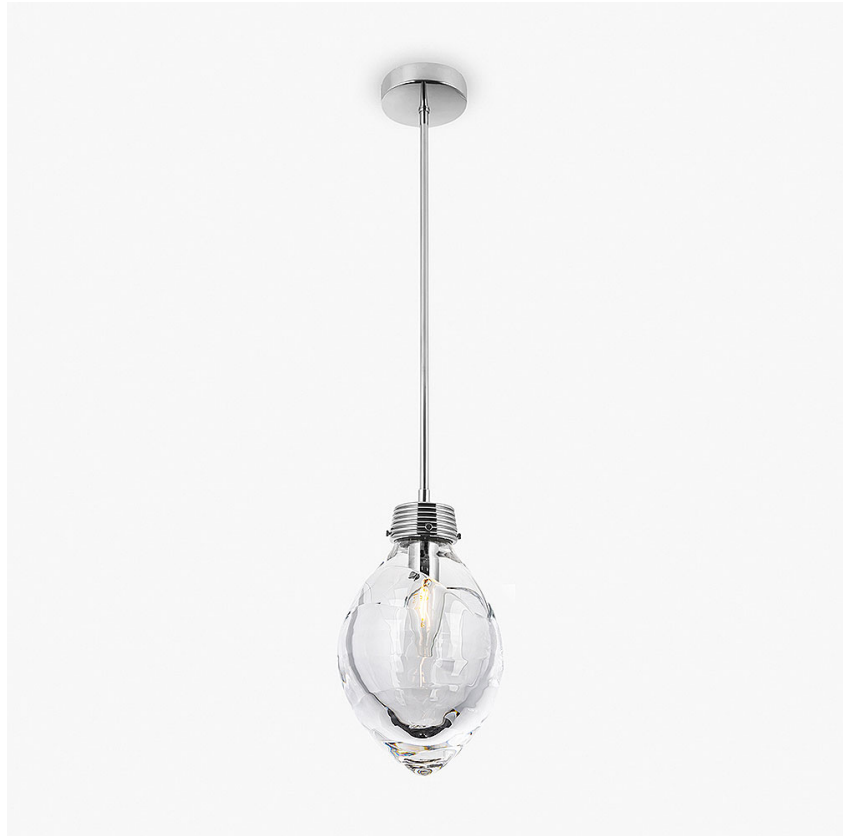
CL660-PEN in Clear Glass and a Polished Nickel Rod