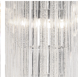
Clear & Silver