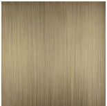
Brushed Dark Bronze