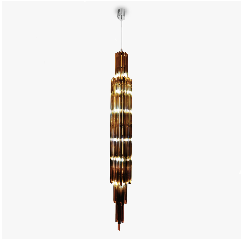
CL460-160 in Smoke Triangular Flat Cut Murano Glass and a Chrome Frame

UL (Underwriters Laboratories) test certificates available for the USA - will incur a surcharge IEC (International Electrotechnical Commission) test certificates available - will incur a surcharge