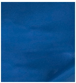
Cobalt Murano Glass