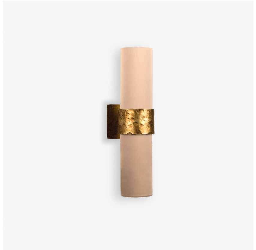
WL57 in Hammered Antique Gold and WL57-Shades in Crepe Satin 1806W-012 Frosted Almond