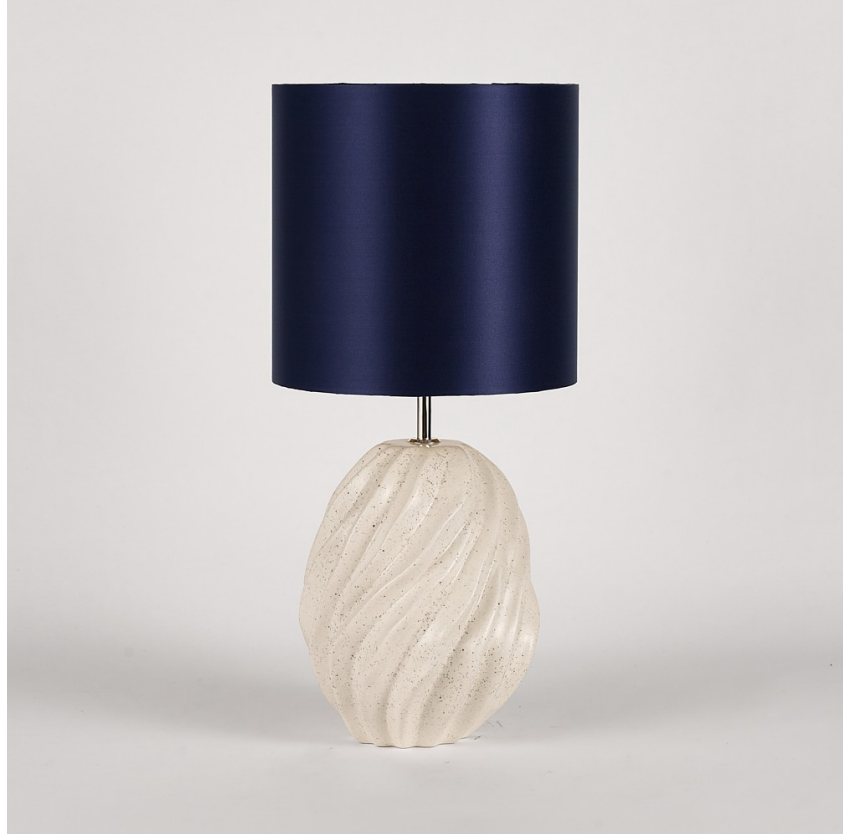
TL821 in Jasper and Polished Brass with 10" Tall Drum Shade in Bennett's Crepe Satin Prussian 1806W/86