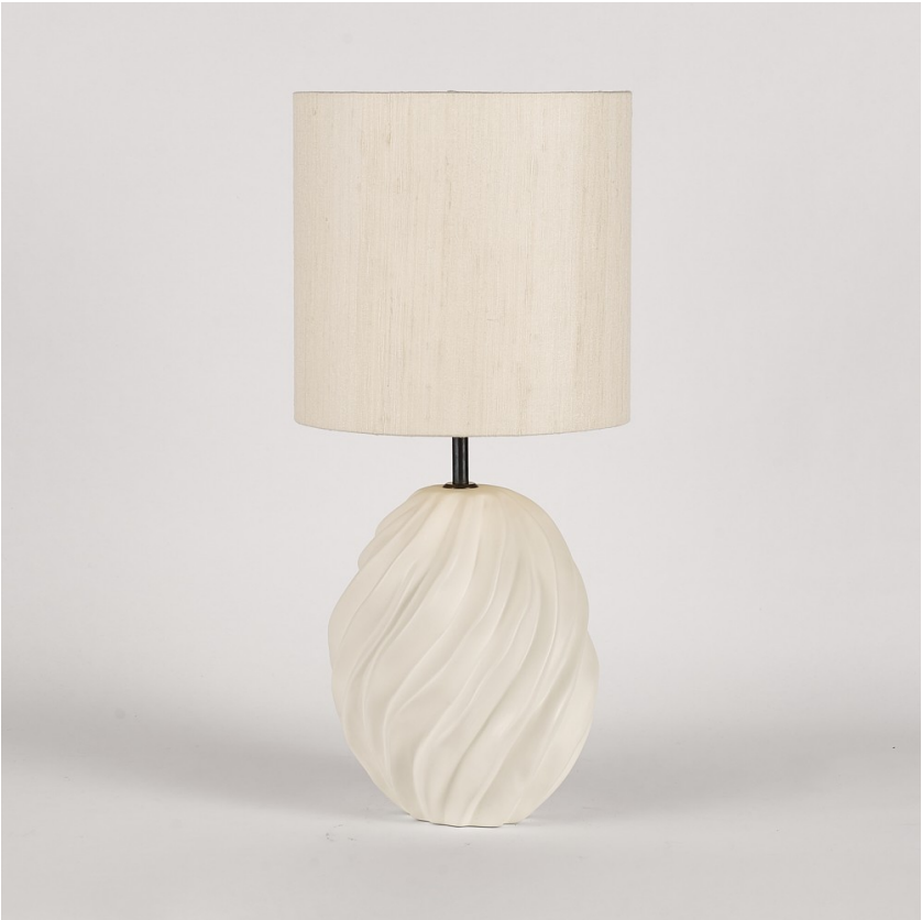
TL821 in Chalk and Bronze with 10" Tall Drum Shade in James Hare Vyne Silk Ivory 31625/01