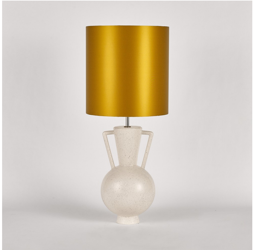
TL823 in Chalk and Polished Nickel with 12" Tall Drum Shade in Bennett's Crepe Satin Ochre 1806W/70