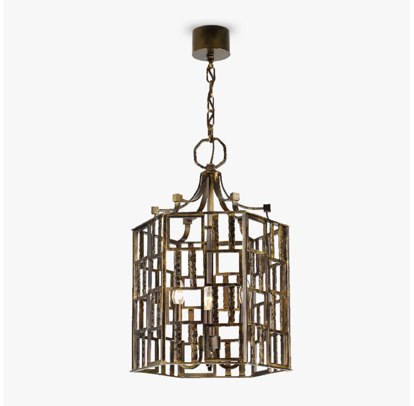
CL51-LAN in smooth and hammered decorated bronze

UL (Underwriters Laboratories) test certificates available for the USA - will incur a surcharge IEC (International Electrotechnical Commission) test certificates available - will incur a surcharge