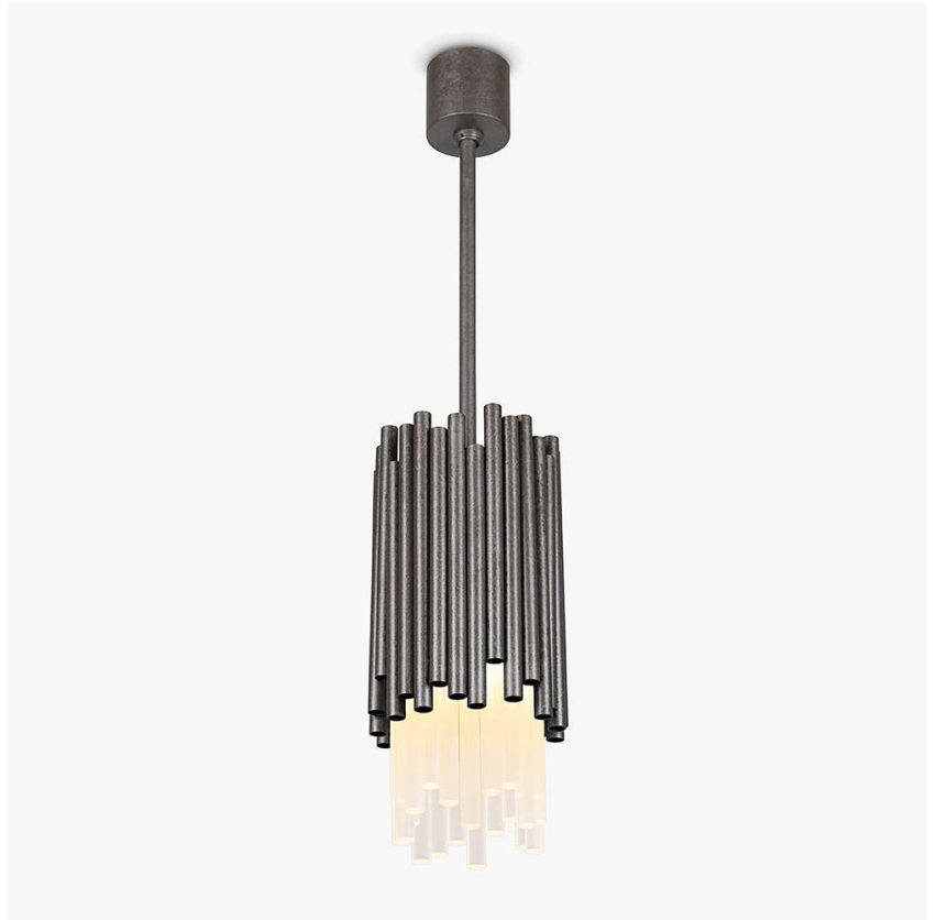
CL109-PEN in Frosted and Stippled Silver

IEC (International Electrotechnical Commission) test certificates available - will incur a surcharge