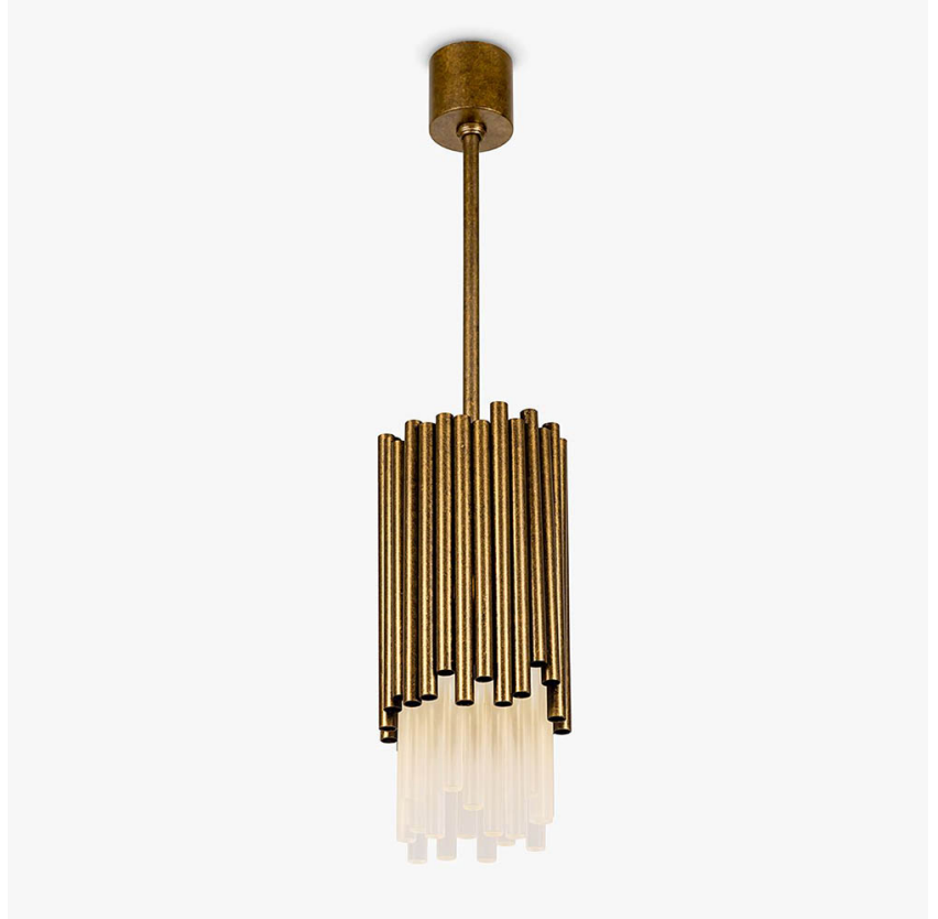
CL109-PEN in Frosted Lucite Rods and Stippled Gold Rods

IEC (International Electrotechnical Commission) test certificates available - will incur a surcharge