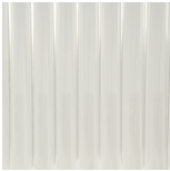
Clear Lucite Rods