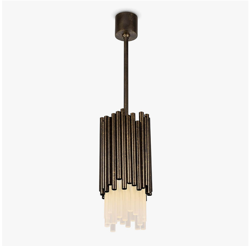
CL109-PEN in Frosted Lucite Rods and Stippled Bronze Rods