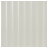
Frosted Lucite Rods