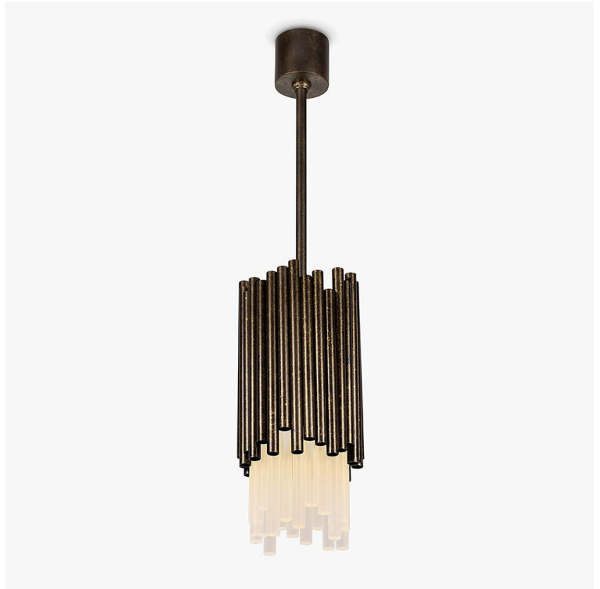
CL109-PEN in Frosted and Stippled Bronze