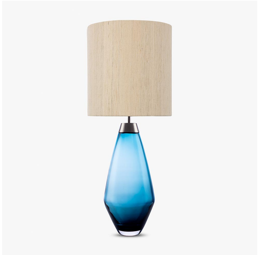
TL661 in Steel Blue and Brushed Nickel with 12" Tall Drum Shade in Silk Linen 3998/Natural N