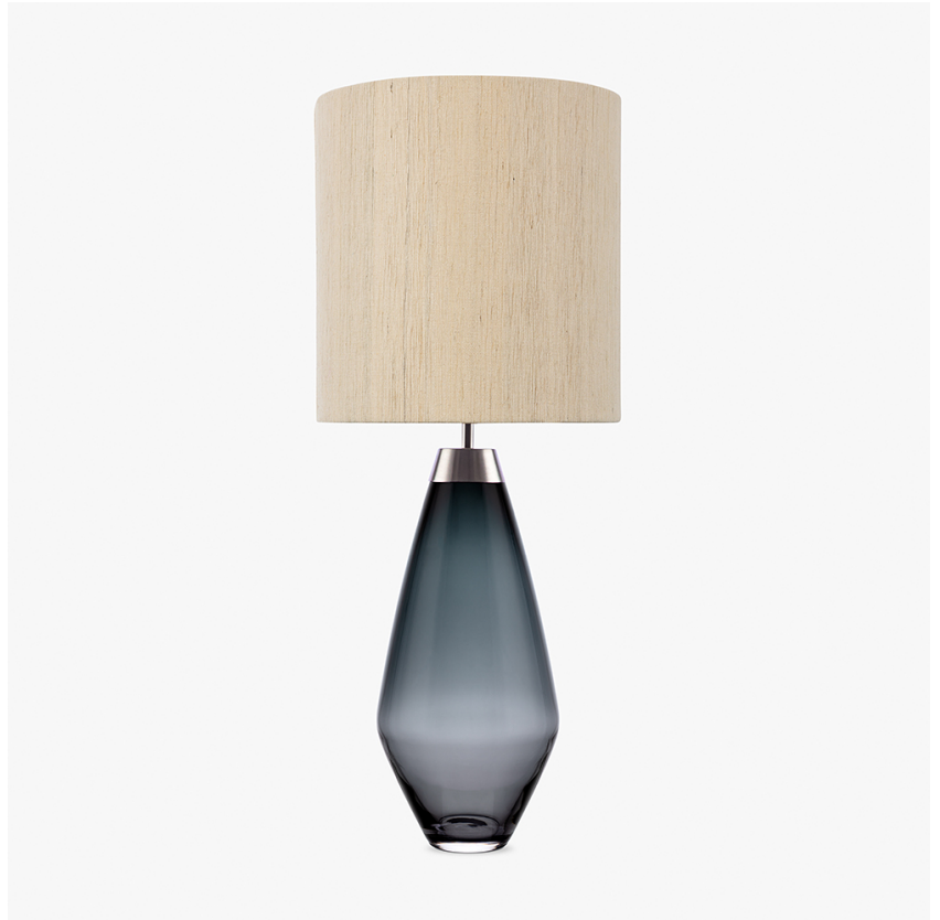
TL661 in Wolf Grey and Brushed Nickel with 12" Tall Drum Shade in 3998/ Beige