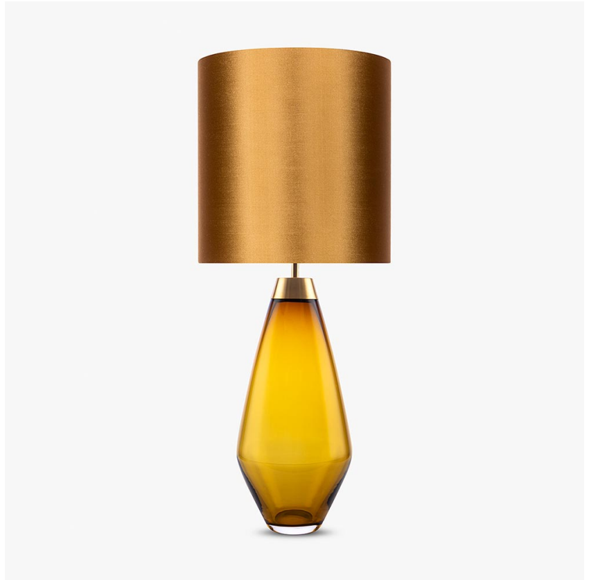
TL661 in Amber and Brushed Gold with 12" Tall Drum Shade in Silk Crepe Satin 1806W/ 70 Ochre