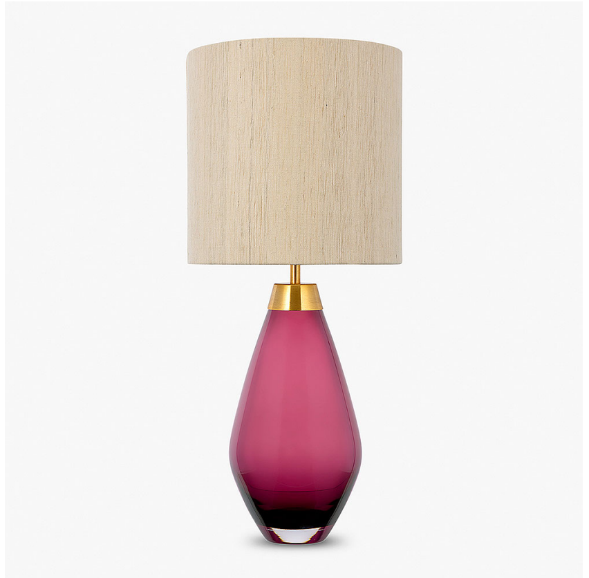
Bijou Lamp in Heliotrope and Brushed Gold with 9" Tall Drum Shade in Silk Linen 3998/Natural N