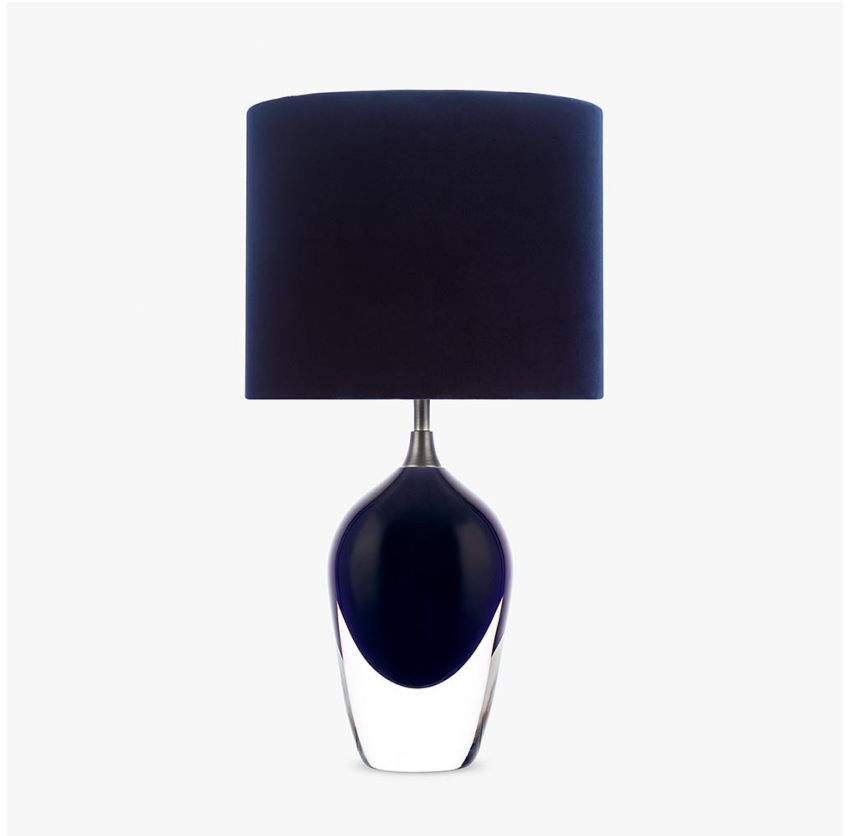
TL663 in Storm and Pewter with a 12" Oval Shade in James Hare 8308/03

IMPORTANT NOTE - Raincloud, Mahogany, Nightwatch and Ballet glass finishes are currently only available as singles.