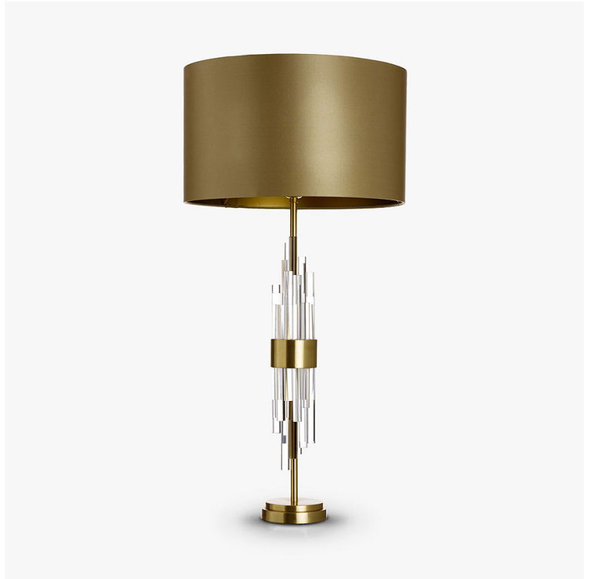
TL122-SM in Clear and Polished Gold with 15" Short Drum in Silk Crepe Satin 1806W-310 Timber Wolf