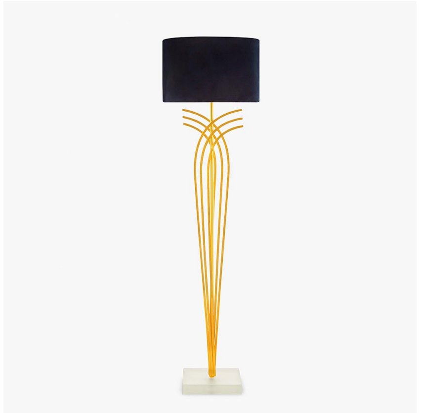
FL209 in Brushed Gold with an 18" Oval Shade in James Hare Midnight 8308/03 Velvet

The Brandt series throws us back into the Art Deco era with a sleek and confident design inspired by one of the most accomplished metalsmiths of the time, Edgar Brandt. The sweeping lines of the original motif are made current by simplification, creating this impressive and highly adaptable design, which gleams as the light falls upon its surface. The table lamp and floor lamp in this series are made with a solid glass base, in your choice of a statement Gloss Black or soft, ethereal Satin which echoes the celestial look which runs throughout the Moonlight collection.