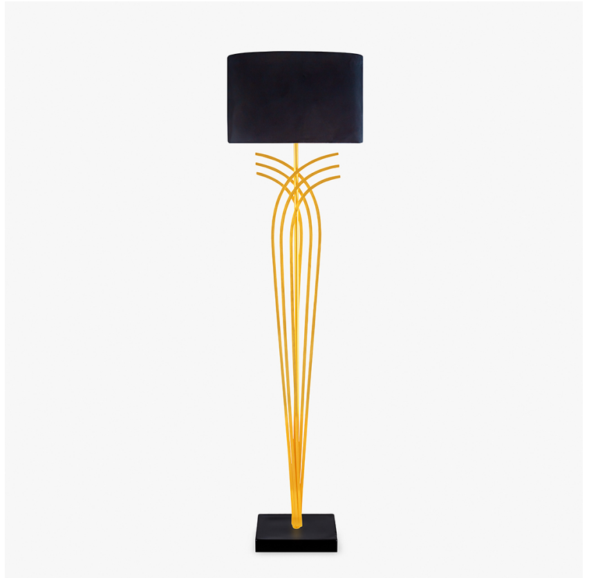
FL209 in Brushed Gold with an 18" Oval Shade in James Hare Midnight 8308/03 Velvet

The Brandt series throws us back into the Art Deco era with a sleek and confident design inspired by one of the most accomplished metalsmiths of the time, Edgar Brandt. The sweeping lines of the original motif are made current by simplification, creating this impressive and highly adaptable design, which gleams as the light falls upon its surface. The table lamp and floor lamp in this series are made with a solid glass base, in your choice of a statement Gloss Black or soft, ethereal Satin which echoes the celestial look which runs throughout the Moonlight collection.