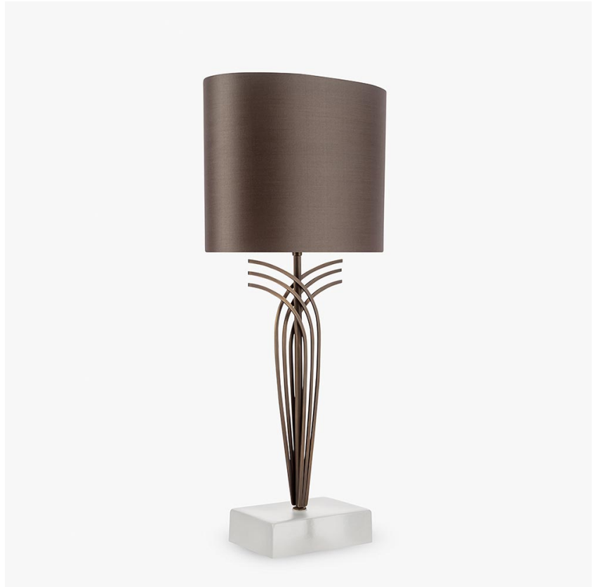
TL209 in Brushed Bronze with a 12" Oval 38000/136 Manta Ray