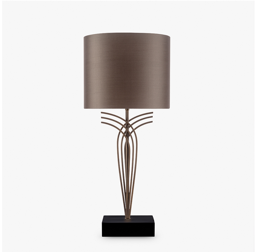
TL209 in Brushed Bronze with a 12" Oval 38000/136 Manta Ray