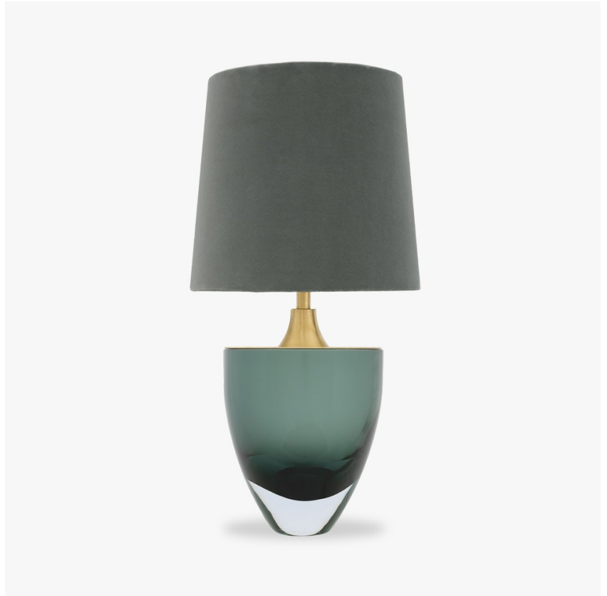
TL714-SM in Petrol Blue & Clear and Brushed Gold with 12" Walton Shade in James Hare Blue Grey Beauchamp Velvet 8308/12