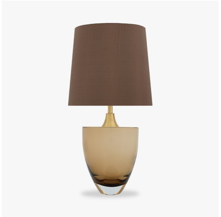
TL714-SM in Tobacco & Clear and Brushed Gold with 12" Walton Shade in Bennett's Dupion Silk 126