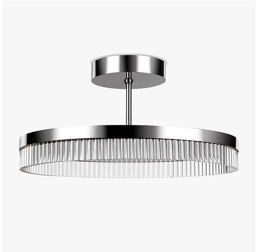
CL123-S-100 in Clear Lucite Rods and Polished Nickel with Distressed Mirror