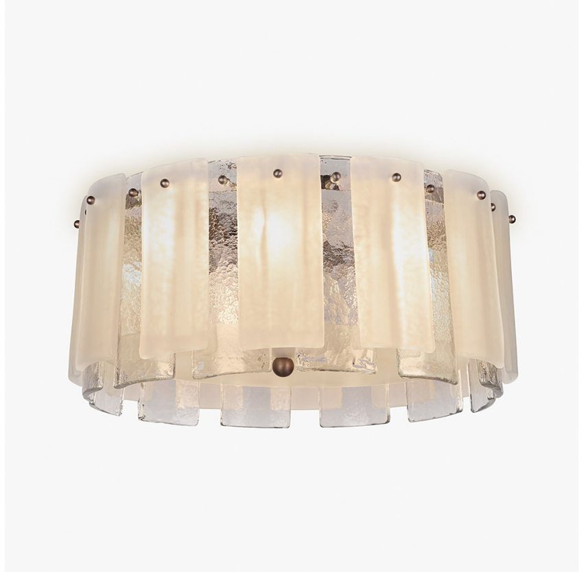
CL213-FM in Satin with Clear Glass and Brushed Bronze