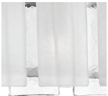
Lunar Satin with Clear