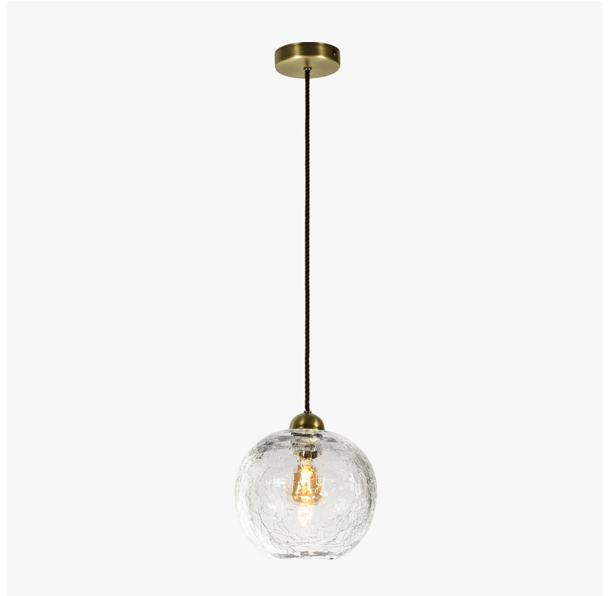
CL375 in Clear Cracked and Brushed Bronze with Brown Flex

Glittering crevasses lace the surface of our Arctic range, glinting flawlessly as they catch the light. A classic crackle technique made in England from pure lead crystal for heightened clarity and allure; these pieces provide stand alone simplicity or are the perfect complement to our intricately cut Glacier range. Use them individually or make use of our customisation service to group several together for a completely individual look.