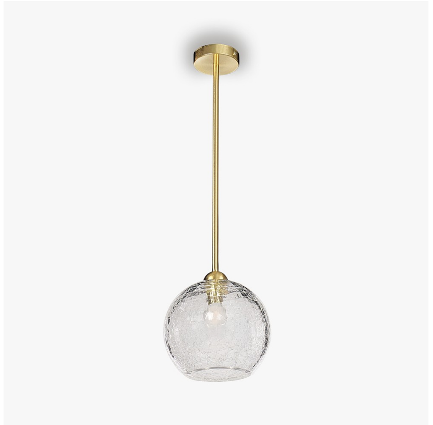
CL375 in Clear Cracked and Brushed Gold

Glittering crevasses lace the surface of our Arctic range, glinting flawlessly as they catch the light. A classic crackle technique made in England from pure lead crystal for heightened clarity and allure; these pieces provide stand alone simplicity or are the perfect complement to our intricately cut Glacier range. Use them individually or make use of our customisation service to group several together for a completely individual look.