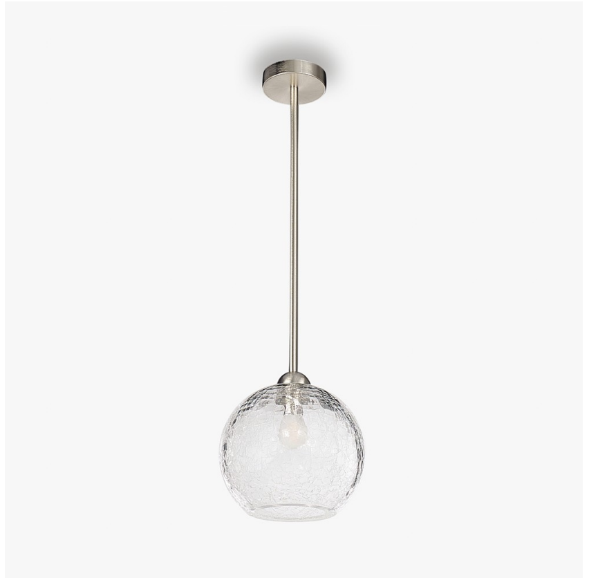
CL375 in Clear Cracked and Brushed Nickel

Glittering crevasses lace the surface of our Arctic range, glinting flawlessly as they catch the light. A classic crackle technique made in England from pure lead crystal for heightened clarity and allure; these pieces provide stand alone simplicity or are the perfect complement to our intricately cut Glacier range. Use them individually or make use of our customisation service to group several together for a completely individual look.