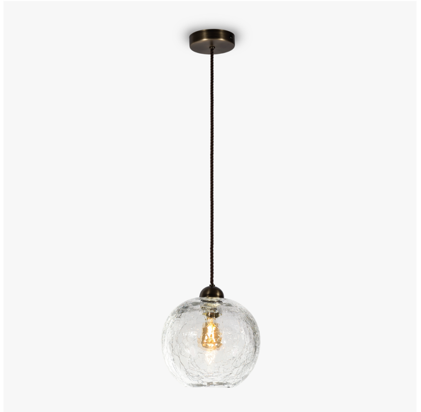
CL375 in Clear Crackled Glass and Brushed Dark Bronze with Brown Flex