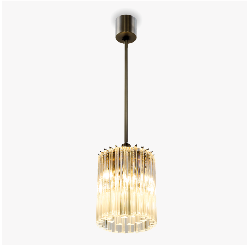
CL412-25 in Clear Triangular Flat Cut Murano Glass and Brushed Dark Bronze

IEC (International Electrotechnical Commission) test certificates available - will incur a surcharge