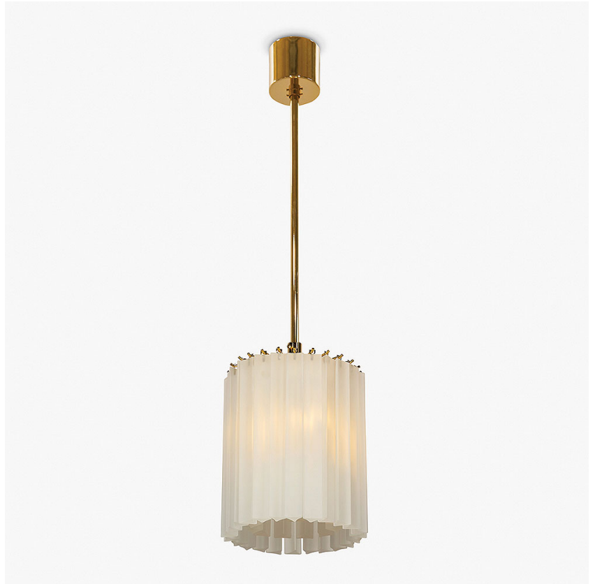
CL412-25 in Satin Triangular Flat Cut Murano Glass and Polished Gold

IEC (International Electrotechnical Commission) test certificates available - will incur a surcharge